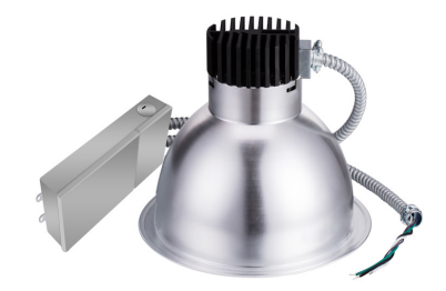
CRLX10-18-40W-MCTP Complete Unit